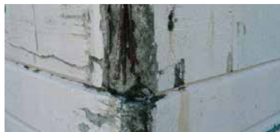
A wall corner was severely damaged