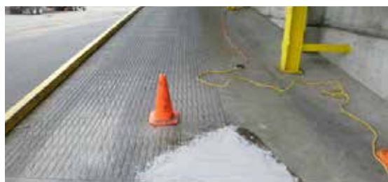
The Belzona 4151 + 4111 system was used to rebuild and smooth the cracked area