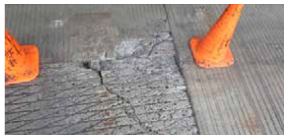
A concrete panel had cracked causing problems on the road

Excellent bonding to metallic and masonry surfaces including concrete, brick, marble and stone.