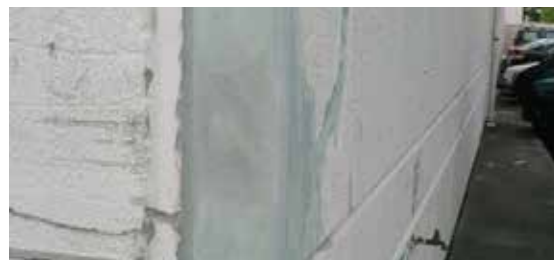
Belzona 4151 was injected before cracks were filled with Belzona 4111

For more information, please contact your local Belzona representative: