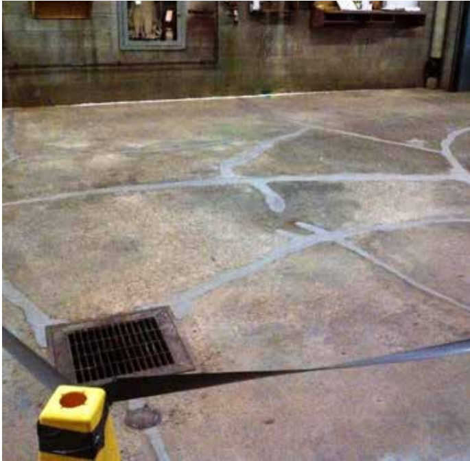
Crack repaired with Belzona 4151 and 4111 system

Belzona 4151 (Magma-Quartz Resin) is a two component coating suitable for protecting concrete substrates from moisture ingress and chemical attack.